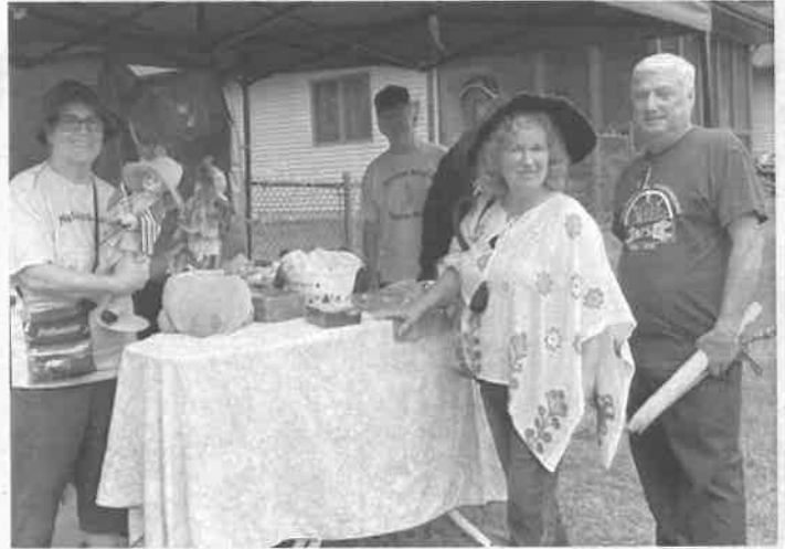
Vintage Sale raises money for the 175th birthday celebration.

A big thank you to all who participated in donating items, setting up, cleaning up, acting and working stations. Also, we want to thank Thrivant Financial for their monetary support. It was a fun afternoon.